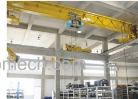
Single Girder Cranes

We offer infinite solutions adapted to meet customers' requirements. Our unique design is made to suit different needs and stringent dimensional requirements for hook approach, headroom, end clearances, etc.