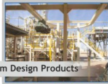
Custom Design Products

We strive to provide solutions to all your material handling needs