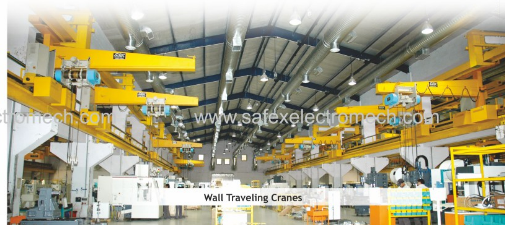
Wall Traveling Cranes