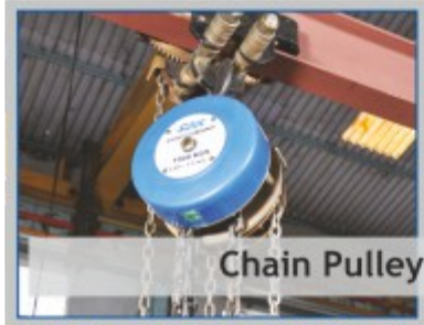
Chain Pulley Blocks