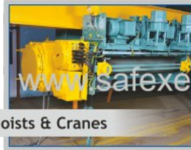
FLP Hoists & Cranes