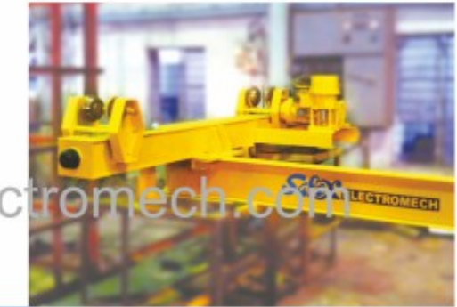
Under Slung Cranes