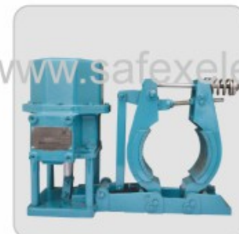
Flame Proof Brake

Safex Electromech Electric Overhead Traveling Cranes are available in various designs up to 100 tonnes capacity, 34 mtrs. span and 60 mtrs. height of lift.