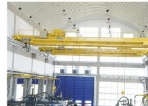
Double Girder Cranes