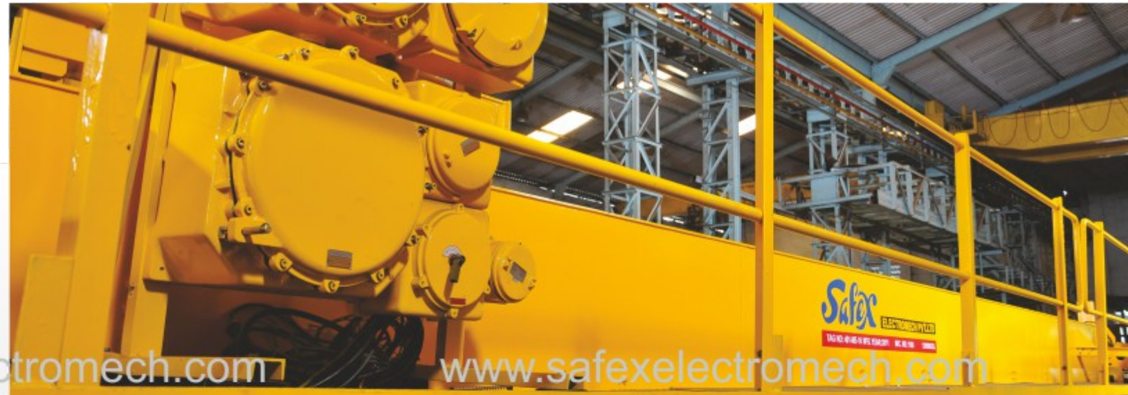
Suitable for: Zone 1, Gas Group IIA, IIB & Zone 2, Gas Group IIA, IIB, IIC